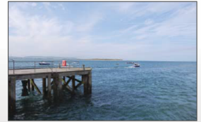
Pier with the bell suspended below it just visible on the far left

Take a minute to look at the Time and Tide Bell, an art installation which hangs below the pier which was commissioned from sculptor Marcus Vergette in July 2011. Near the top of the rising or falling tide, a gentle tolling of the bell can be heard and is a reminder of the well-known legend of the lost land of 'Cantre'r Gwaedod'. Gwyddno Garanhir, the 6th century king who ruled over the low lying land, had a man in charge of a system of sluices, dykes and embankments that kept the sea at bay. Unfortunately after feasting and drinking heavily one night the guard forgot to close the sluice gates and the sea rushed in, drowning the land and its people. It's said that its the bells can still be heard ringing from beneath the water.