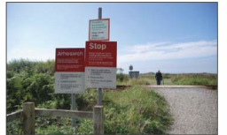
Warning signs at the railway crossing

Heed the warnings here and continue to the golf course.