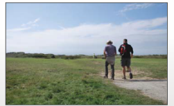
Heading across the golf course