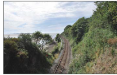
Cambrian coast railway line from the bridge near 'Picnic Island'.

From Picnic Island cross over the railway footbridge to reach the main road. Take great care on this short section as you cross the road and turn right it is safer on the left hand side where you can be seen more easily by passing vehicles. Then after about a hundred metres turn left through a gap in the wall and follow a very pleasant path up through woodland and over a small stream to emerge on a steep tarmac road behind buildings that are part of the Outward Bound centre.