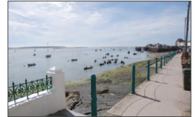
Pavement leading from the quay

Continue along the quayside and pavement beside the estuary, taking great care where the pavement runs out for a short section before The Penhelig Arms.