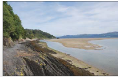
Looking along the 'Roman Road' towards Picnic Island

Picnic Island is another misnomer – it was in fact a small peninsula now separated from the 'mainland' after being cut off by a cutting for the railway in 1863. Nevertheless it has a small grassy area on top with a bench that would be a pleasant spot for a picnic.