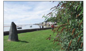
Memorial stone commemorating World War Two commandos

A total of 130 men served in the troop which was a very unusual unit of the British Army with most of the troop having German, Austrian or Eastern European backgrounds, others were political or religious refugees from Nazi Germany. All members of the troop adopted British names and false personnel histories.