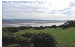
Path up through fields above the Outward Bound centre

This was the world's first Outward Bound centre. It opened in 1941 as 'The Outward Bound Sea School' and it's now a worldwide organisation. During World War Two it taught important survival skills that saved the lives of many merchant seamen, and today the centre provides a base for a whole range of adventures for young people in the great outdoors.