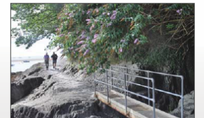
The scenic rock-cut path of the 'Roman Road'

Although known as the 'Roman Road' it was in fact built for horse and carriage in 1808. The sea has by now eroded much of this old road but it rarely floods even at high tide so it's safe for a stroll any time of the day - just make sure you wear good shoes as it can get quite slippery when wet.