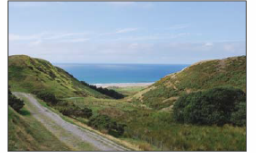
Track down valley leading to the Tywyn road.

Head straight through the narrow field to a gate in the furthest corner, then keep to the right near the fence (no obvious path here) to reach a wide track. Turn left along this track and head all the way down the narrow valley, with a beautiful view of the beach and sea beyond.