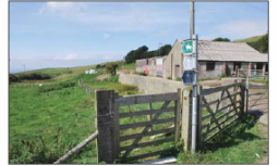
Wooden gates by Crychnant farm

Go straight across at a T-junction along a rough track to reach another tarmac section of road leading to Crychnant farm. Turn left just before the farmyard through the wider of two wooden gates. The signpost between the two gates seems to suggest going through the smaller gate, but this leads to a fully enclosed and fenced off field.