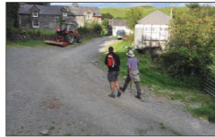
Through Trefrifawr farmyard

Continue up the hill and through a metal gate into the field immediately behind the Outward Bound centre and head for an old corrugated iron shed. Continue straight up through the field, following the Public Footpath sign across a track, and straight on up to a small gate into woodland. Emerge from the wood onto a tarmac road and follow it to the farmyard of Trefrifawr farm.