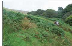
Steeper walking above Trefrifawr

Continue through the farmyard and turn left almost immediately behind the farmhouse, through a short section of woodland and through a wooden gate out onto the open hillside. Follow the steep path, keeping right near the fence towards the top of the hill, to reach a gate through to level ground and the top of the ridge.